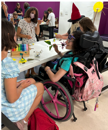
At Central Library - Special needs young person loved the Unicorn song we sang, joyfully asked to sing again and again

Weaving on such large looms necessitated working together, which lead to lots of offering and asking for help