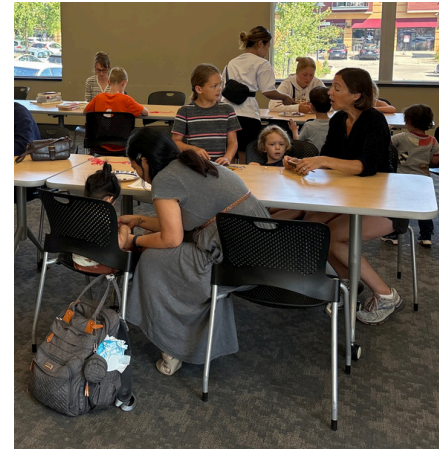
Actively participating at Sequoya Library