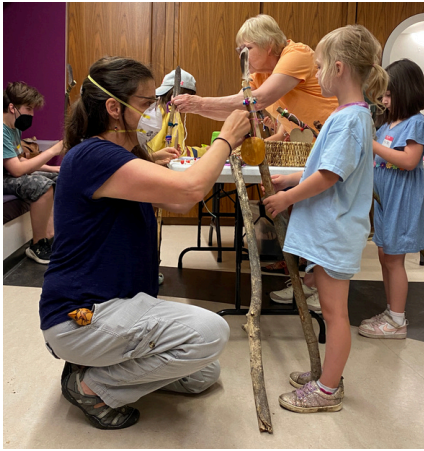
Asking or offering help at Central Library