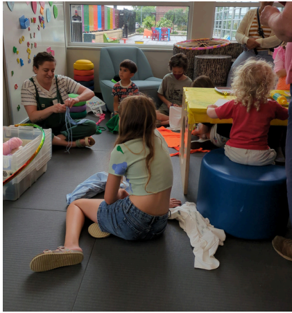
Asking or offering help at Pinney Library