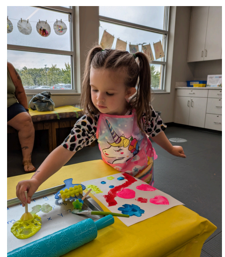
At Pinney Library - Colorful creating! She ended up going around to ALL the tables and ALL the paint and ALL the tools!