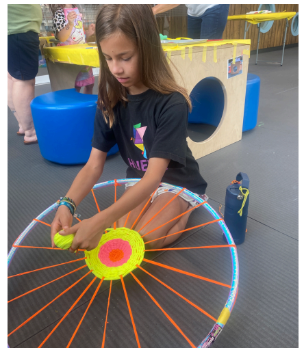
At Pinney Library - Determined to keep her color choice, this child found a work around with a new material