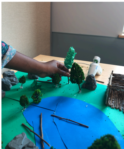
At Lakeview Library - So much pride!! D. Created a beautiful tree out of Model Magic